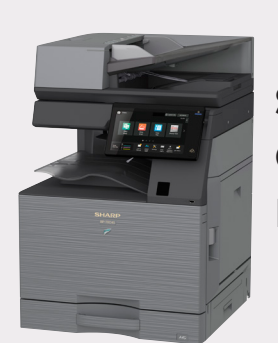
Security-First Copiers and Printers

From dark web protection to password management, experts can help prevent, identify or remediate threats like policy violations, fraudulent activity and security gaps.