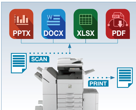
Scan and convert documents to popular file formats seamlessly with Sharp's built-in OCR function.