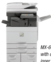
MX-6070N shown with compact inner finisher.

When it's time to get the job done, the Advanced Series color document systems are outstanding performers. Quickly scan documents at speeds up to 200 images per minute . Built-in optical character recognition (OCR) can convert your scanned documents into text-searchable PDFs or Microsoft Office file formats, simplifying your workflow. Use the manual stapling feature on select finishers to restaple your originals. Multiple finishing options give you the output you require, be it stacked, stapled or saddle-stitched. There's even an available built-in stapleless staple feature, which can bind up to five sheets of paper by adding a crimp to the corner of the set, saving regular staples for larger sets.