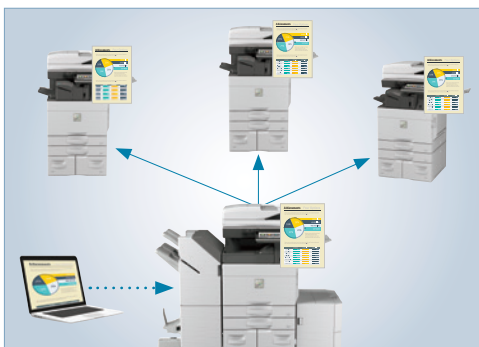
With Serverless Print Release technology you can securely print a job and release it from any of six color Advanced Series models.