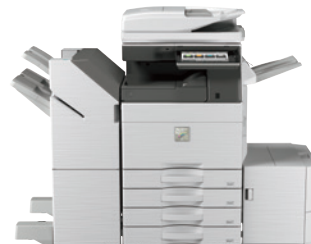
MX-6070N shown with 3K saddle stitch finisher and large capacity cassette.